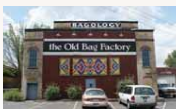
THE OLD BAG FACTORY 1100 CHICAGO AVE., GOSHEN, IND.

Seats are not reserved. If you would like to sit with friends, plan for your party to arrive early, or you can purchase a table for eight people, and we will hold that table for you. You can download a longer registration form at http://www.pumpkinvine.org/html/annual_dinner.html .