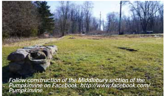
Follow construction of the Middlebury section of the Pumpkinvine on Facebook: http://www.facebook.com/Pumpkinvine .