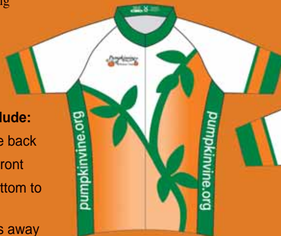
Raglan Sleeve, Club Cut Jersey High Collar, Hidden Zipper