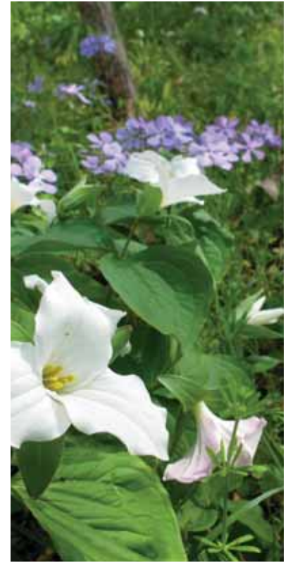
Trillium and blue phlox