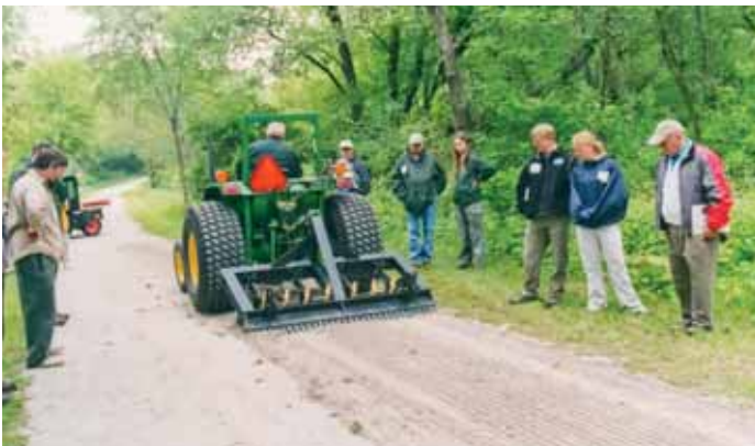
IPRA members watch a demonstration of how to groom a limestone trail, June 4, 2003.