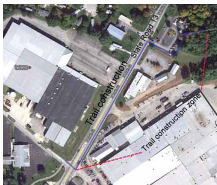
This section of the trail will be closed beginning mid-March, but is scheduled to be finished by the end of May 2013.

“We do not want people continuing west past County Road 43 and getting to the end of the trail with nowhere to