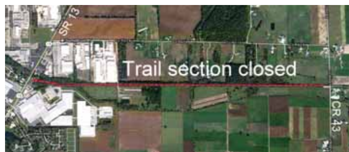
Construction between York Dr. and the end of the current trail east of the Dairy Queen in Middlebury will close a major gap in the Pumpkinvine Nature Trail.