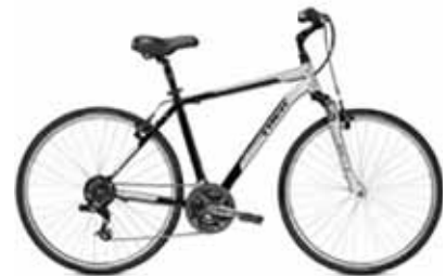
Grand prize: Trek Verve 2 21-speed, suspension fork and seat post

Friends of the Pumpkinvine P.O. Box 392 Goshen, IN 46527-0392