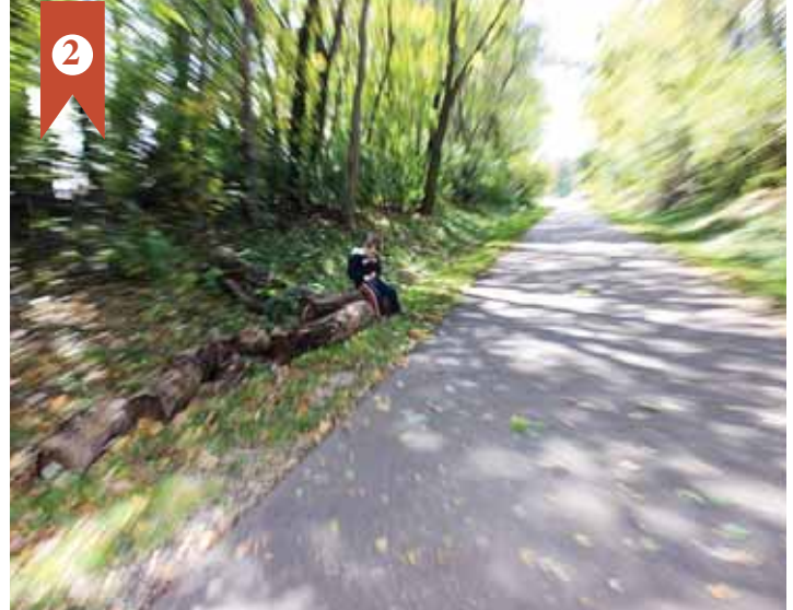
2 nd place: Jessa Caffee