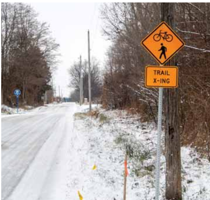
These small trail-crossing signs will be replaced with larger signs.