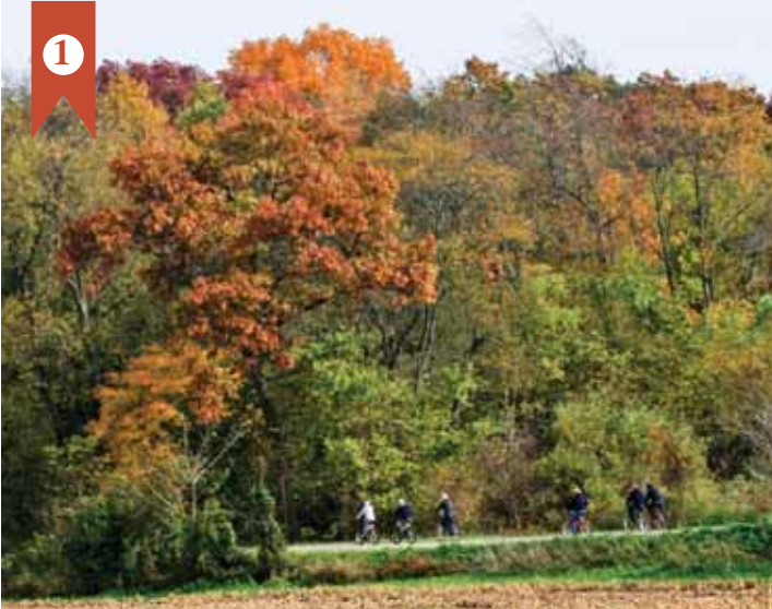
1 st place: Carl Metzler