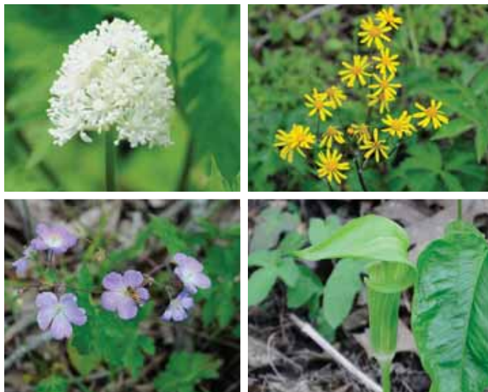
Doll's eyes (top) Wild Geranium (bottom)

The trail signs were funded in part through a $1,000 grant to the Friends of the Pumpkinvine from the IU Health Goshen Community Benefit Fund.