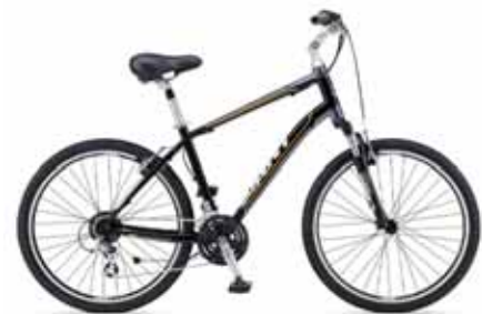
Grand prize: Electra Townie 7D