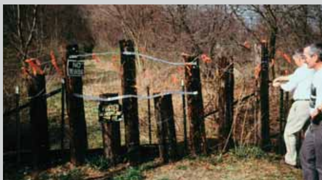
C.J. Yoder cuts fence blocking trail, Mar. 18, 1994

Abshire Park to CR 28 to show off the newly purchased Pumpkinvine corridor. Early in the walk, they encountered trail opponents blocking the trail with a barrier across the corridor constructed of a wire fence attached to railroad ties driven into the ground. The Friends used wire cutters to open a hole in the fence and proceeded to walk the trail from State Road 4 to County Road 28.