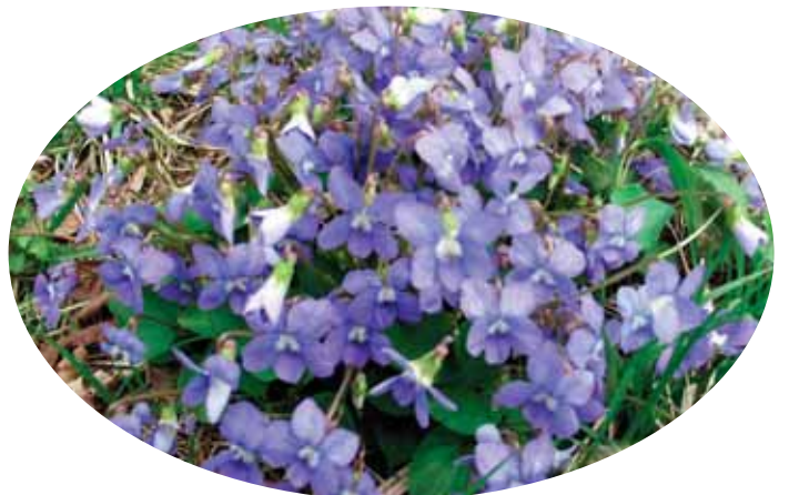
Common Blue Violet