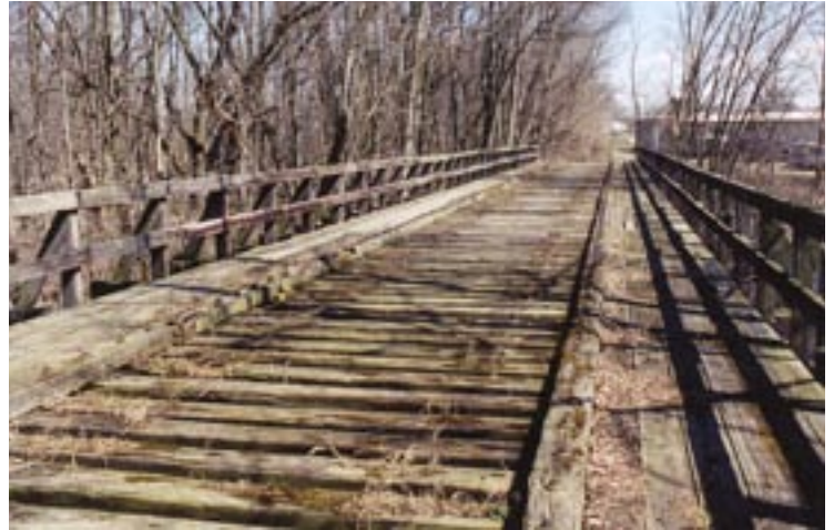
Work to renovate the trestle bridge over the Little Elkhart River began in February. Here are before (top) and after pictures looking north.

Interested individuals or organizations may send a donation to the Middlebury Park & Recreation Board, Linear Greenway Park Fund, PO Box 812, Middlebury, IN 46540. Please include a note indicating how you wish your donation to be used for this project.