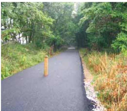
◀ Phase 5A1 (CR 28 to CR 127): Looking north from CR 28. This section was finished in September 2008.