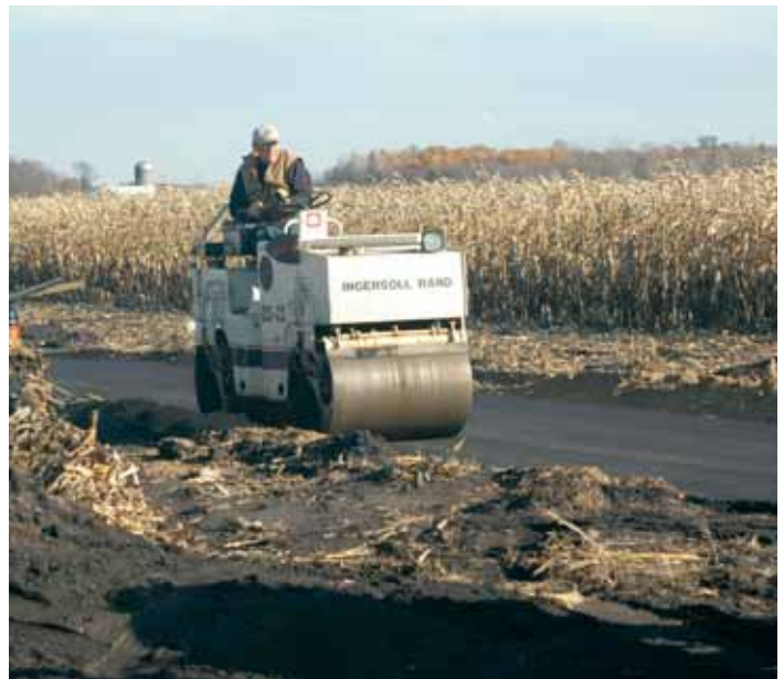
▲ Phase 5A2: Rolling asphalt south of CR 26.

Bontrager Excavating was awarded the contract to build trail from CR 127 to CR 33 (Phase 5A). A table showing the various phases of the trail and the stages of construction is on page 4.