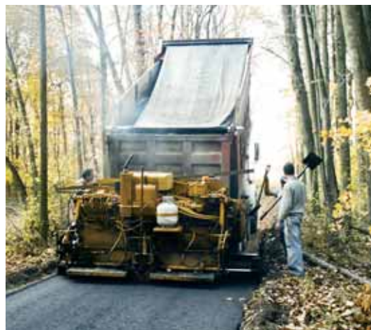
◀ Phase 5A3 (CR 26 to CR 33): Workers put down 10 feet of asphalt on the west of CR 33.